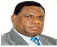
Hon. Patrick Pruaith, CMG, MP Minister for Treasury